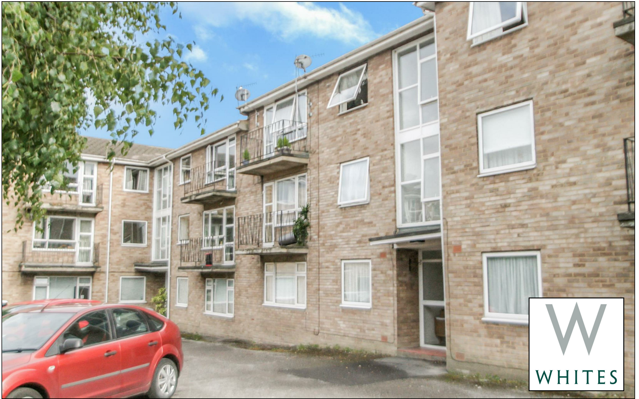
29 Cleveland Flats, Fairview Road, Salisbury, Wiltshire, SP1 1JY